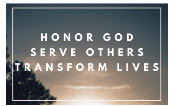
First Christian Reformed Church

We welcome our visitors and hope that you enjoy worshipping with us. If you are presently seeking a church home, we welcome you to join our fellowship. If you would like further information about our church, check out our website at www.waupuncrc.com or contact the church office (324-2898).